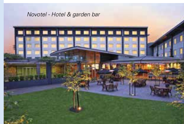
Novotel - Hotel & garden bar

Combined, the Novotel and Ibis Auckland Ellerslie provide 247 refurbished rooms. All guest rooms offer modern and contemporary accommodation featuring king size or twin bedding, state of the art technology with flat screen televisions and broadband internet access.